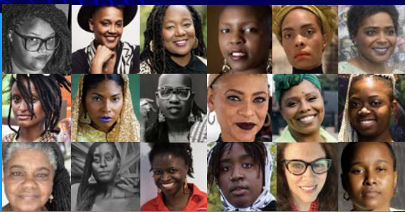
BLATANT - A Forum on Art, Joy & Rage